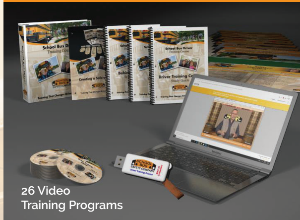
26 Video Training Programs

Available on DVD, Thumb Drive, & Web Based